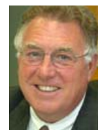
John Petillo Insurance