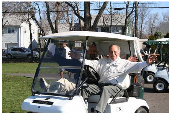
Look Ma, No Hands!