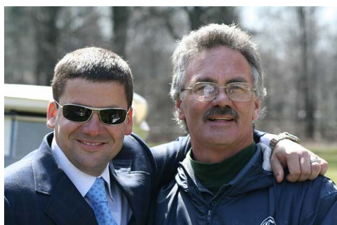
Some of the Men who Made it Possible.