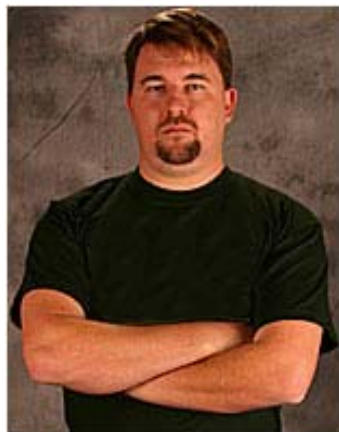
World Series of Poker Champion Chris Moneymaker.