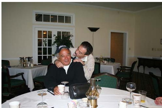
Keep it PG Gentlemen.